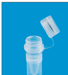
Tube with Looped Cap