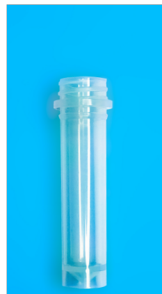
Self standing without knurl- 2 mL