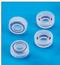
Cap with EPDM 'O' ring