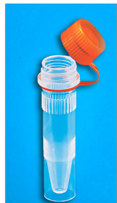
Tube with unassembled Looped Cap (Non-Sterile)