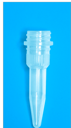
Conical with knurl - 0.5 mL

Add suffix N= Natural, W= White, R= Red, B= Blue, Y= Yellow, G= Green, Z= Amber for color cap.