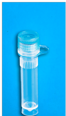
Tube with Looped Cap (Sterile)- 2 mL