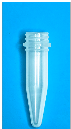
Conical without knurl-1.5 mL