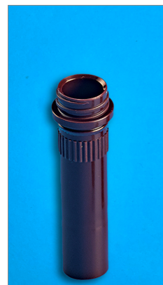
Self standing with knurl - 2 mL