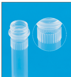
Tube with Knurl